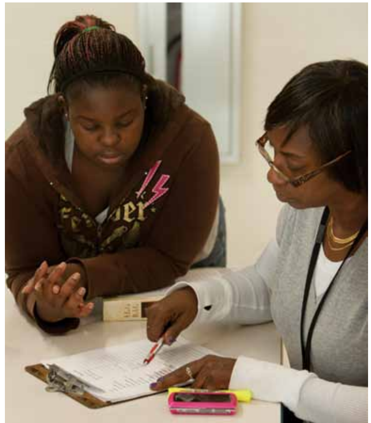
Women at Laura's Home have access to a broad range of resources to help them find good jobs and live independent, stable lives.