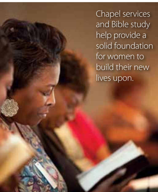
Chapel services and Bible study help provide a solid foundation for women to build their new lives upon.