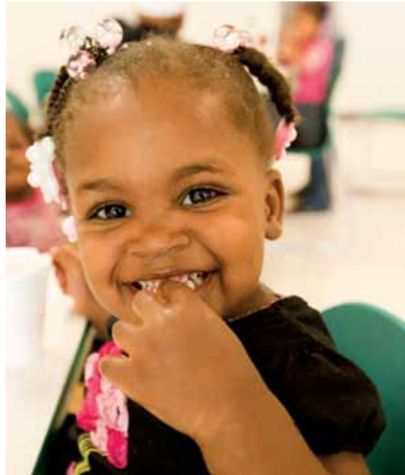
Your support for Laura's Home helps to break the cycle of domestic abuse, homelessness and poverty, making her future a lot brighter!