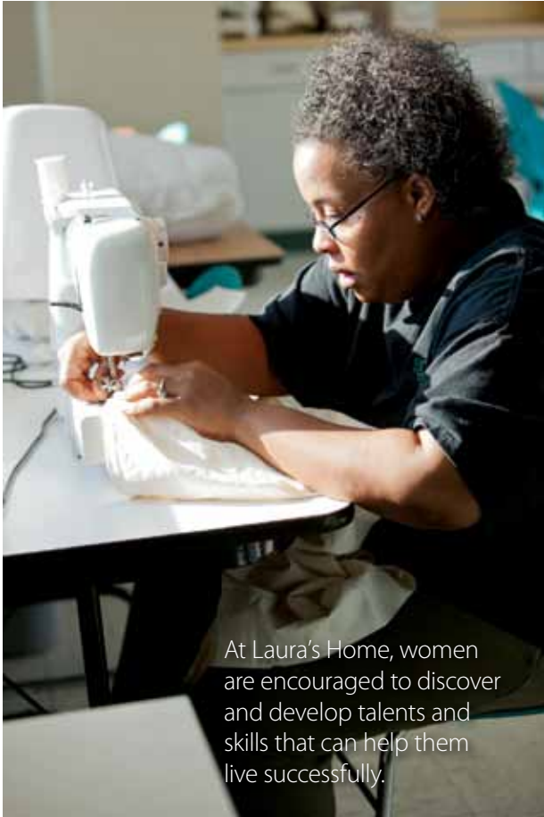
At Laura's Home, women are encouraged to discover and develop talents and skills that can help them live successfully.