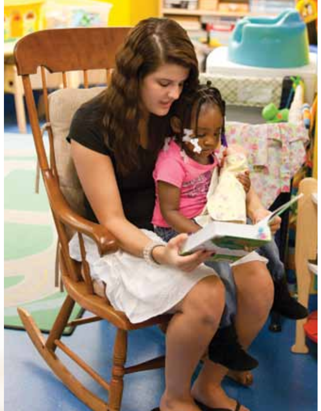
Children too young to attend school get lots of TLC in the day care center at Laura's Home.

Warm beds, hearty meals and basic necessities... women and children in need find all this and so much more at Laura's Home. Since February 2003, your gifts have helped provide shelter, resources, education and the love of Christ to our most defenseless neighbors. Together, we keep hope alive in the hearts of women and children who are torn by homelessness and harsh circumstances...and offer them a chance to change their lives for the better—forever!