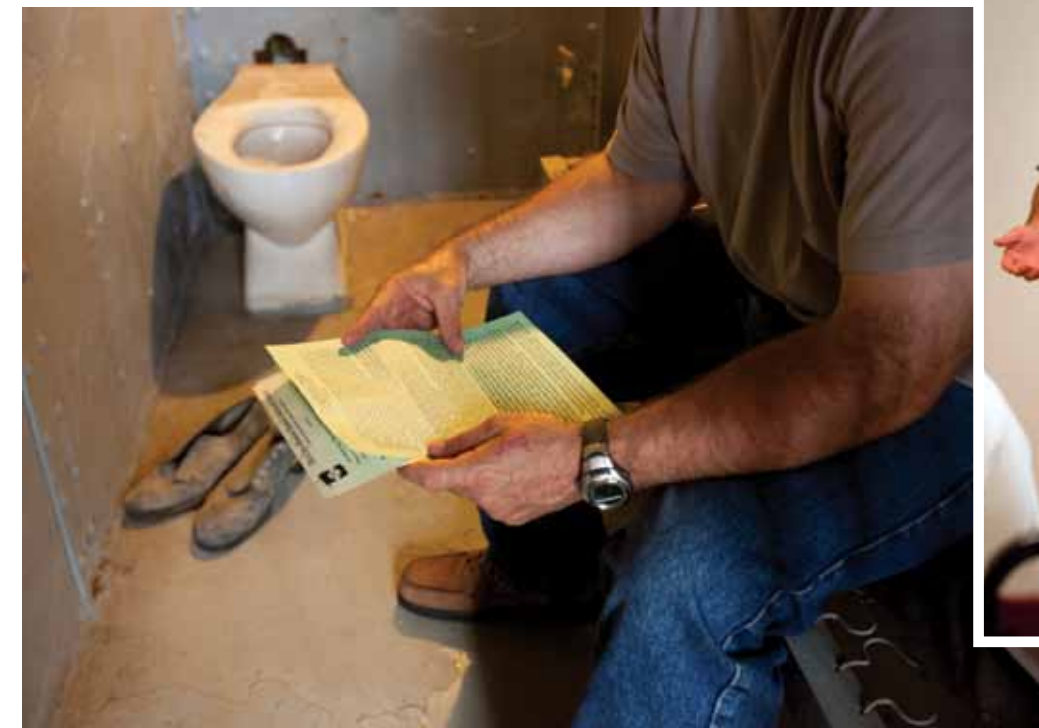
Every year, hundreds of men and women start their journey towards Christ through monthly correspondence provided by Inmate Outreach Services volunteers.