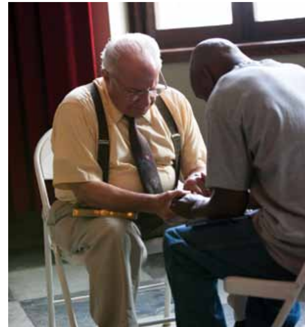
It’s amazing what a difference prayer makes! One-on-one prayer and Christian counseling bring great comfort and hope to men in prison.