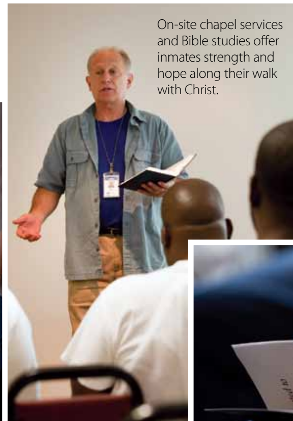
On-site chapel services and Bible studies offer inmates strength and hope along their walk with Christ.