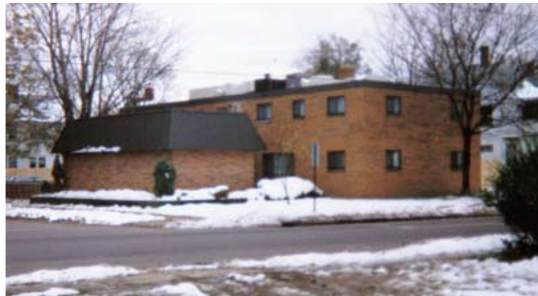
The Angeline Christian Home served as an emergency shelter for women and children and became the inspiration for our current outreach for women and their children, Laura's Home.