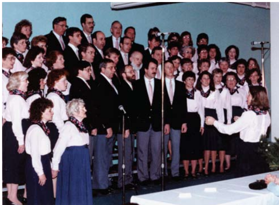
The Promise Choir charms the crowd during the Mission's Holiday Dinner in 1987.

The Lord does not look at the things man looks at. Man looks at the outward appearance, but the Lord looks at the heart.